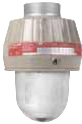
EMI30 & HID

Listed - Files E10514 and E91793 (Marine)